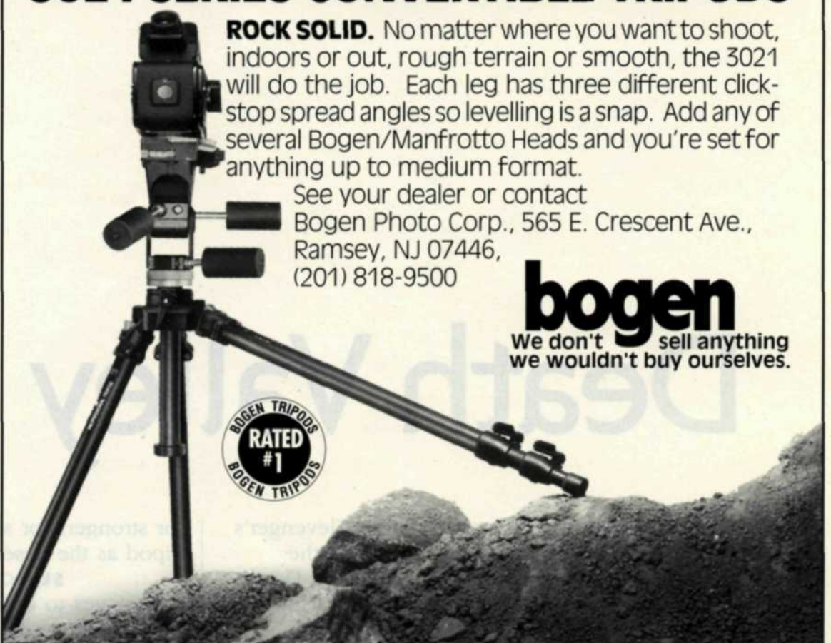
Circle #351 on Reader Service Card